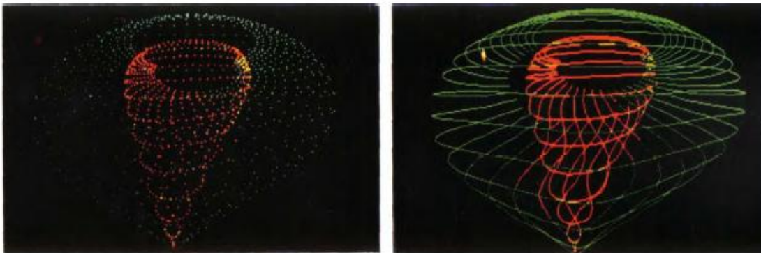
The 3-D mapping showing the tracks of the particles in a particular "vortex in a vortex"

For me this is a huge validation of the Leadbeater work. This is not the only validation, electron microscopy has determined that the hydrogen atom is indeed two intersecting triangles as presented in Leadbeater.